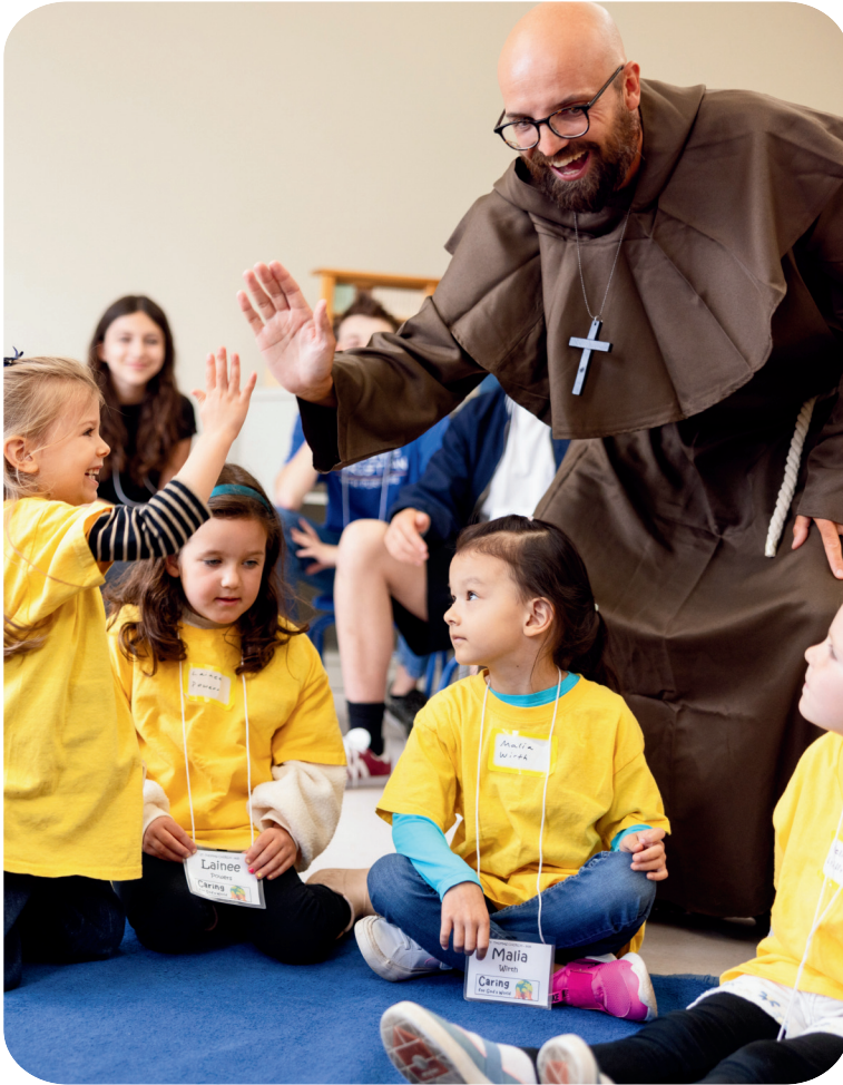
Flashback to when "Saint Francis" visited Caring for God's Creation campers this past summer. Celebrate St. Francis Day today with a pet blessing in Medina Park, 12:30-1:30pm.

At St. Thomas Church, we strive to be a community where the dignity of every human being is seen and honored. As Christians, we seek to welcome all of God's people, celebrating the fullness of their being that is inclusive of race, ethnicity, sexual orientation, education, faith history, age, economic status, sex, gender identity and expression, language, physical and cognitive ability. We seek to be the Body of Christ where all members feel safe, loved and that they belong. Whoever you are, and wherever you are on your spiritual journey, there is a place for you at St. Thomas!