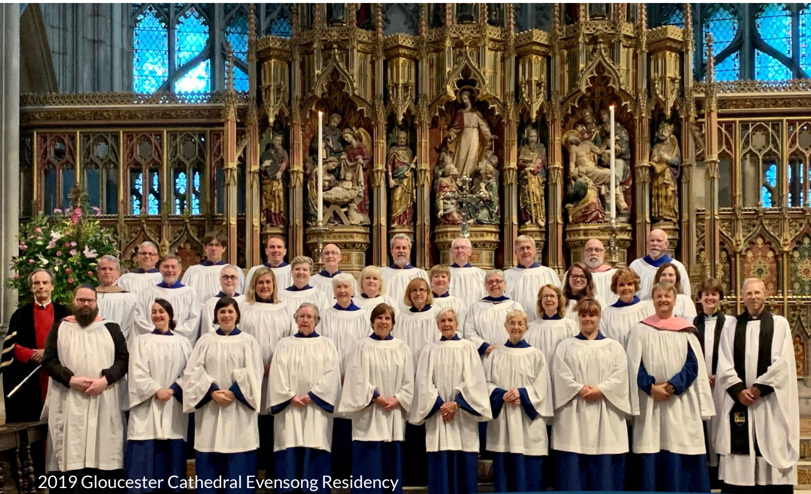
2019 Gloucester Cathedral Evensong Residency

Sunday, May 19 | 4:00 PM Choral Evensong: Pentecost